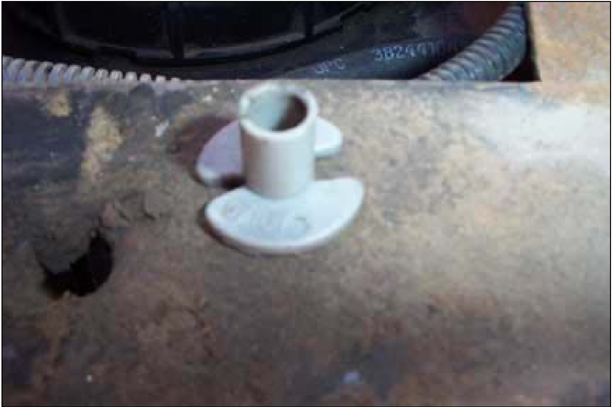
Figure 1- Line release tool