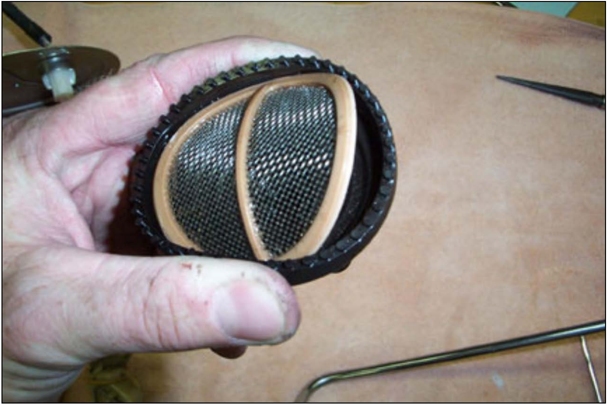
Figure 7 – Removing Filter Screen