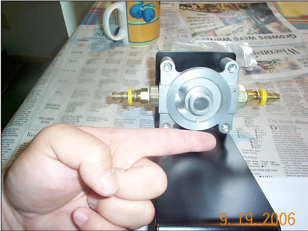
Figure 11 – Filter Head Mounted on Bracket – Finger Indicates Flow Direction