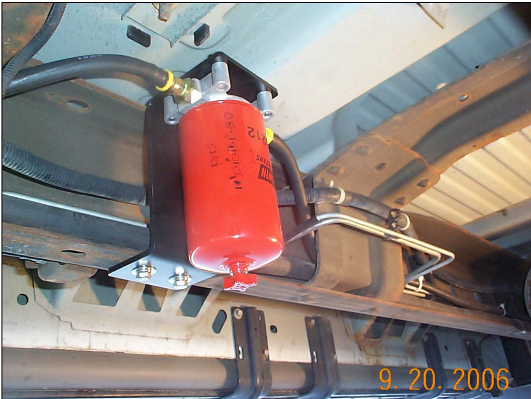
Figure 12 – Filter Bracket Mounted Inside Frame Rail (Excursion Shown)