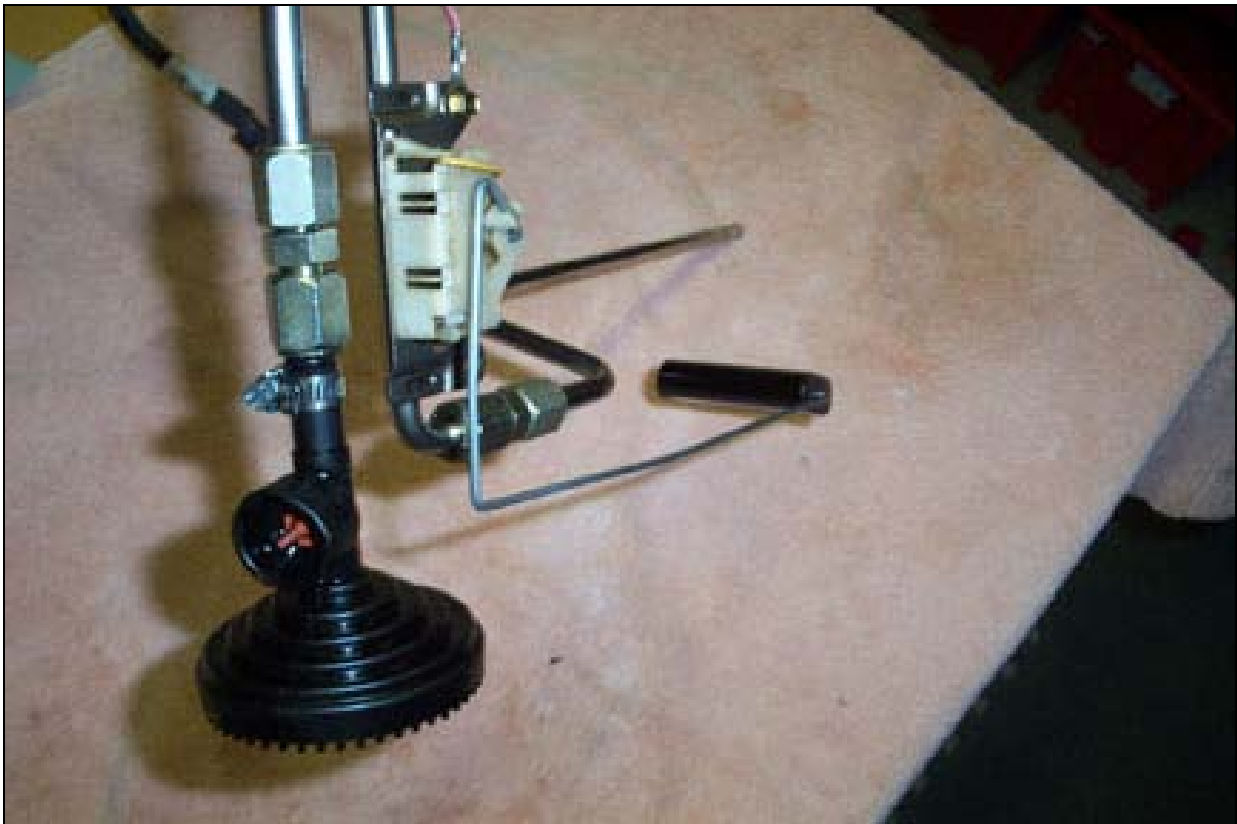
Figure 10 – Ready for installation