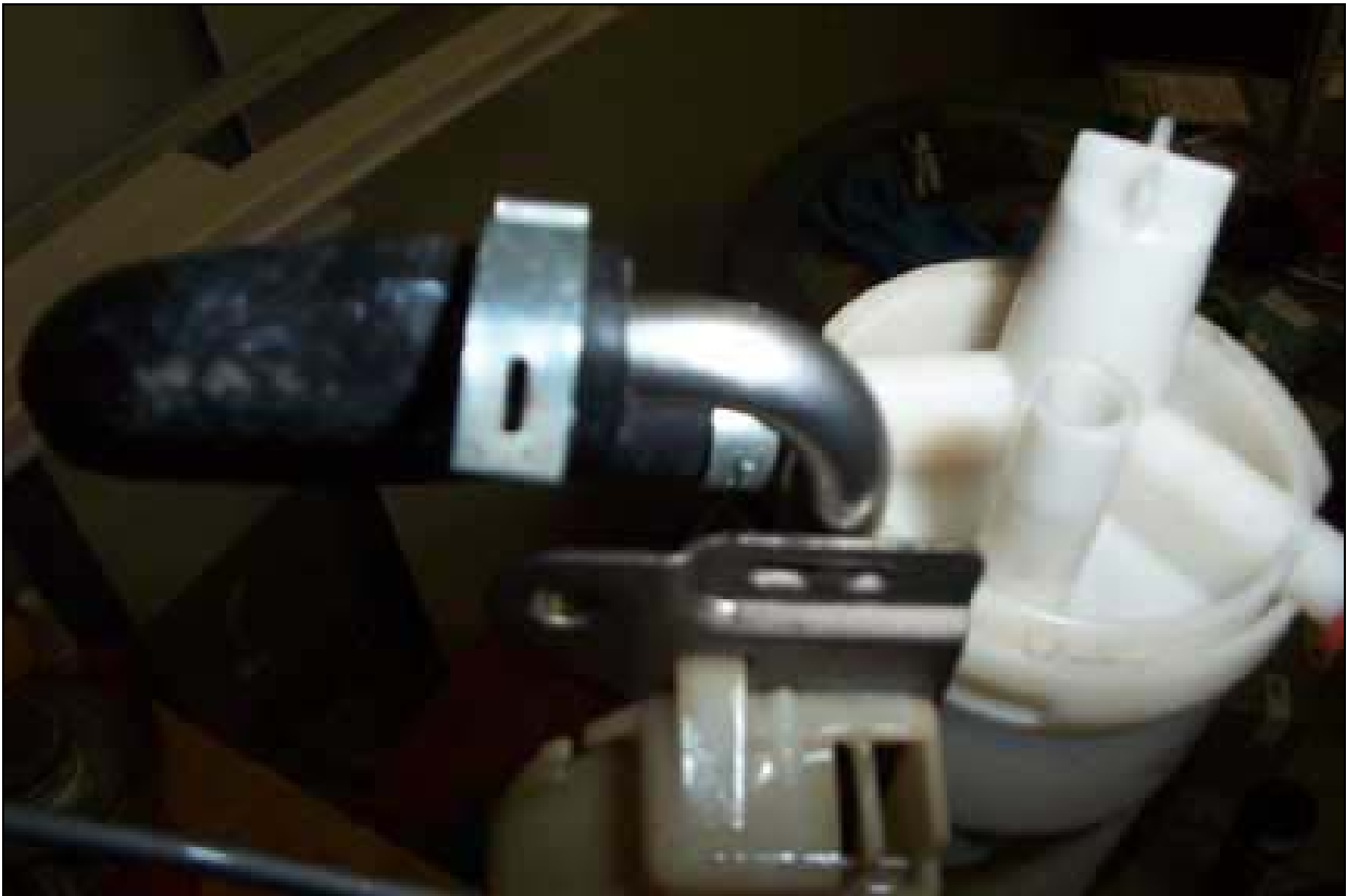
Figure 4 - Cutting the hose clamp