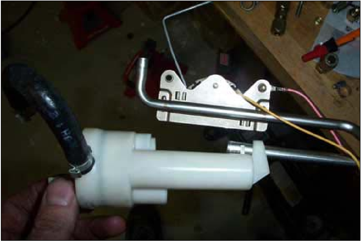
Figure 5 - Removing the mixing valve