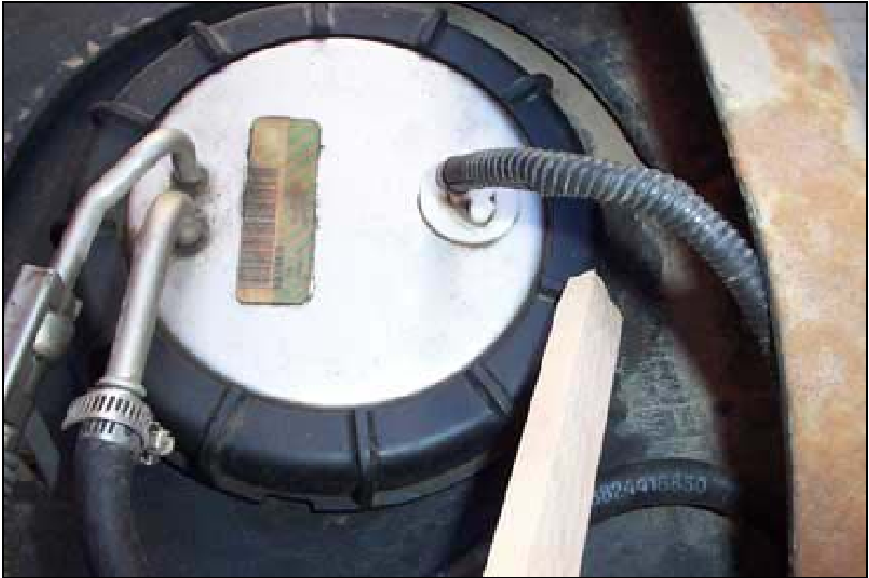
Figure 2 - Removing the lock ring