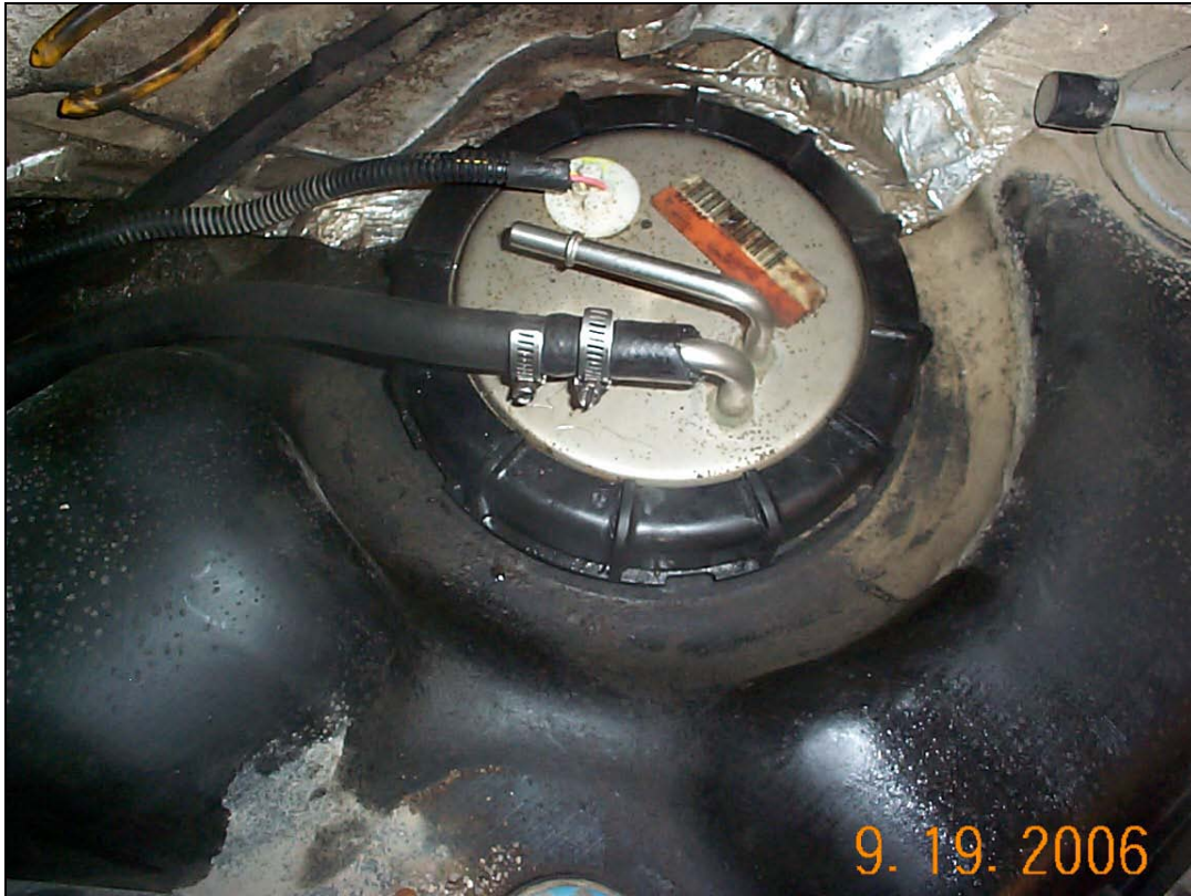
Figure 13 – New Fuel Line Double Clamped on Pickup Tube (Excursion Shown)